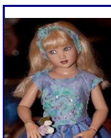
Blue Hues Bethany

The day's dinner was and introduced two new Bethany dolls - a Bethany.