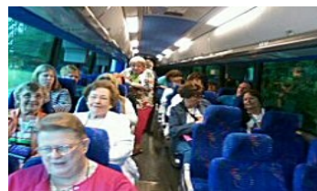
Attendees on Tour

As with the two previous years, our convention unofficially began with a pair of optional tours bringing attendees to many of the wonderful sights of Winston-Salem, North Carolina on Tuesday and Wednesday including the Reynolda House and Old Salem.