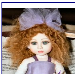
2010 Creedy Doll