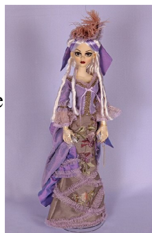
A Gathering Storm Evangeline

The final meal of the day was the Storm" which presented two Evangeline (with three separate hair styles) and the