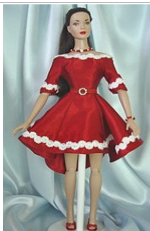
Crimson & Ice by Denise Beaudins