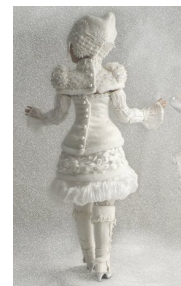
Entry Number 03 Snow Queen by Judith Markich