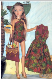
Entry Number 04 had Ellowyne taking an Adventure by Proxy by Pat Merrill