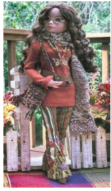
Entry Number 06

As another "First Ever", second place was shared by both one of the favorites of the MDCC board: